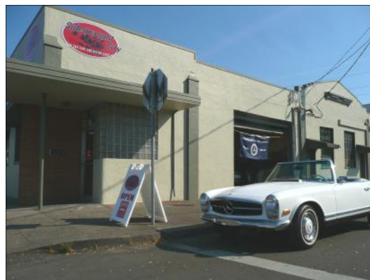
A 250SL at Sidedraught City

Portland Section members in attendance will be entered into a raffle for $75 in Griot's Garage products. As a special bonus, we will start the grill and bar-b-que hot dogs and burgers for Portland Section members. Come and join the party on September 28th!