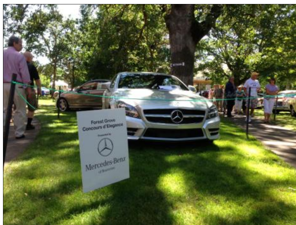
Above: Presenting sponsor Mercedes-Benz of Beaverton displayed a 2013 CLS-550, a 2014 E350 and a 2013 E300 at Forest Grove.