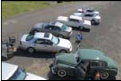
The MBCA Portland Section car corral.

The Portland Historic Races were held again last month at PIR, and once again we were graced with the sights and sounds of an intoxicating array of cars: Formula Atlantic, NASCAR, Indy, Le Mans, and SCCA cars – all beautifully prepared and all eager to take to the track.