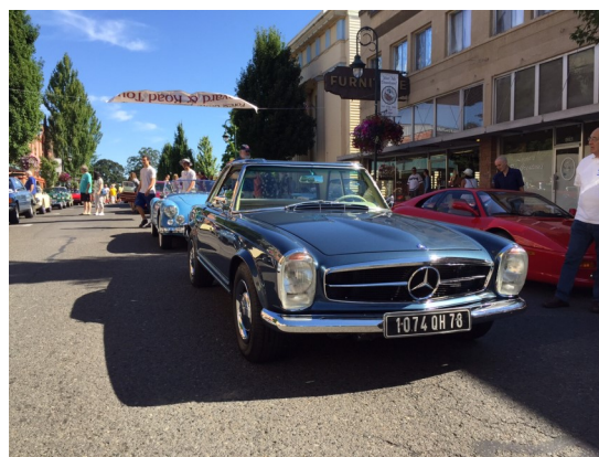
1967 250SL on the Saturday tour