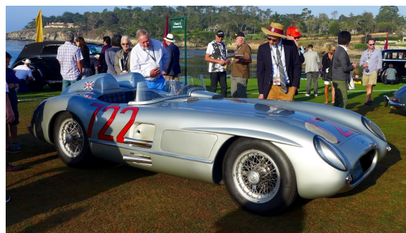
1955 300SLR "722" at Pebble Beach Concours d'Elegance