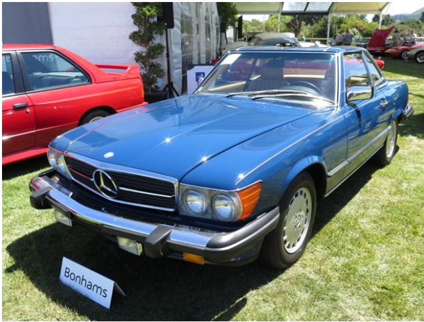
'87 560SL at Bonhams with just 9250 miles sold for 57K !

2015 Monterey auction weekend proves again to be a great turnout for buyers and sellers. Seems like every auction had a great 300SL roadster and or gullwing blue chip collectible on hand and there were plenty of W111 convertibles available for bidding. It is great to see the hobby so active and vibrant. I went to RM, Rick Cole, Gooding, and Bonhams to see the offerings. Gooding had a great 600 SWB limousine that sold for $130k and two 3.5 coupes on hand that sold for $179k and $130k. W113 pagoda's were at every auction commanding $80-$209k. Some of the best examples brought mid-market money while other cars exceeded expectations, proving once again that Monterey is a destination for buying and selling nice cars. The w107 560SL is starting to get good attention as Bonhams had a low mile example for sale. These cars have been gaining popularity in the collector car market and the classic styling is starting to gain ground.