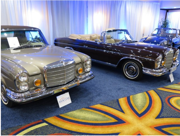
Rick Cole had several interesting convertibles

2015 Monterey auction weekend proves again to be a great turnout for buyers and sellers. Seems like every auction had a great 300SL roadster and or gullwing blue chip collectible on hand and there were plenty of W111 convertibles available for bidding. It is great to see the hobby so active and vibrant. I went to RM, Rick Cole, Gooding, and Bonhams to see the offerings. Gooding had a great 600 SWB limousine that sold for $130k and two 3.5 coupes on hand that sold for $179k and $130k. W113 pagoda's were at every auction commanding $80-$209k. Some of the best examples brought mid-market money while other cars exceeded expectations, proving once again that Monterey is a destination for buying and selling nice cars. The w107 560SL is starting to get good attention as Bonhams had a low mile example for sale. These cars have been gaining popularity in the collector car market and the classic styling is starting to gain ground.