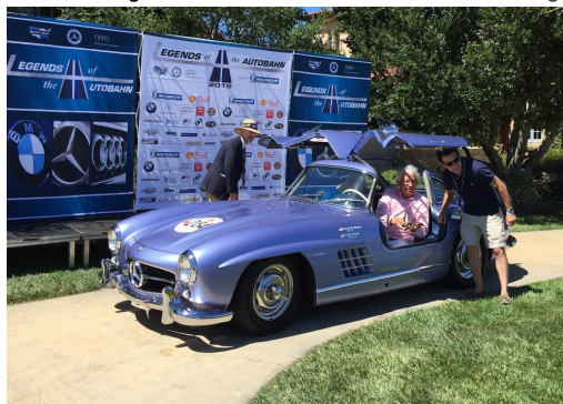
300SL Gullwing in Silver Violet at Legends