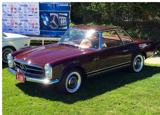
Best in Marque & a 100 pt. W113 Pagoda at Legends of the Autobahn