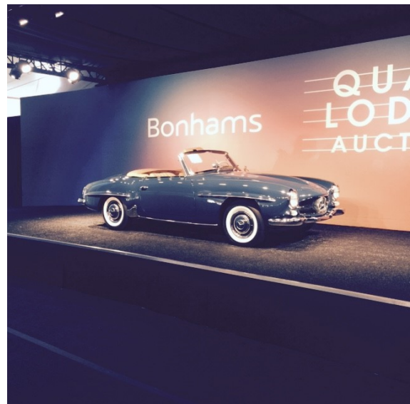
'59 190sl at Bonhams sold for 162k