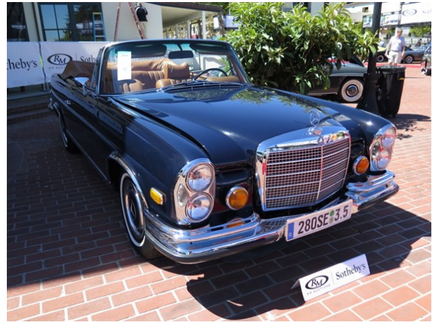
RM Sotheby's w111 Cabrio sold for 429K