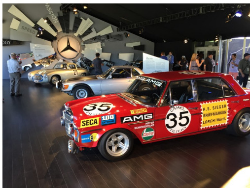
The MB Star Lounge at the Pebble Beach Concours d'Elegance