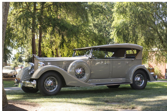
Best in Show 2015: 1934 Packard Dual Cowl Sport Phaeton owned by Larry Nannini.

The 43 rd Forest Grove Concours d'Elegance was held under the trees at Pacific University on July 19 th . Over 300 classic and sports cars, including 15 classic Mercedes-Benz automobiles, were on display. The main focus of the Concours was a 'Grand Classic', a meet for Classic Car Club of America members. Over 50 full classics were on display. A special display of Modern Super Cars attracted a crowd of spectators, and the Concours also celebrated 60 years of the Ford Thunderbird. The Mercedes-Benz class included cars entered for judging, and cars entered by MBCA members in the display-only 'corral'. New member Viju Deenadayalu entered his newly-acquired 1967 250SL. Members Paul and Stephanie Pietrowski submitted their black 1985 500SEL for a MBCA Silver Star Preservation certification. MBCA National Concours Judge Richard Simonds led the judging team this year. First in the Mercedes-Benz class was awarded to Ernie at Pat Brawley for their 1960 190SL. Second in class was captured by Walt Tabrum for his gorgeous 1960 220SE Coupe. And third in class was awarded to Dan and Chris Beard for their very original 1964 220sb sedan. The 44 th Forest Grove Concours d'Elegance will take place on July 17 th 2016. MBCA members are encouraged to participate, and we hope to see you next year