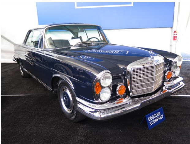
Gooding's with a w11 coupe